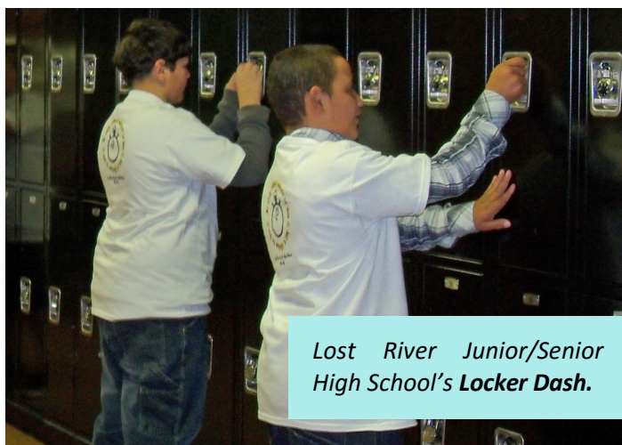
Lost River Junior/Senior High School's Locker Dash .